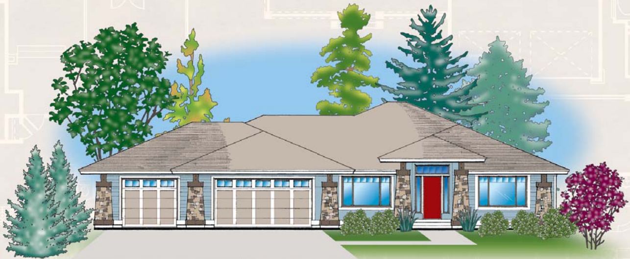
ELEVATION 2541 RANCHER